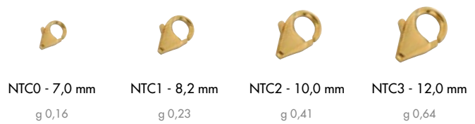
NTC0 - 7,0 mm g 0,16