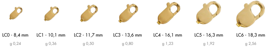
LC0 - 8,4 mm g 0,24